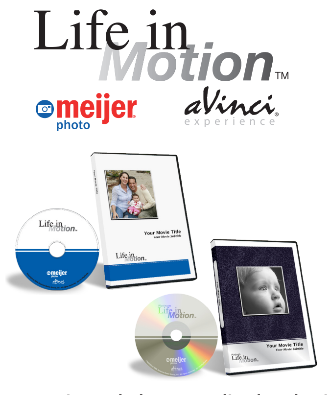
DVD Movies Include Personalized Packaging